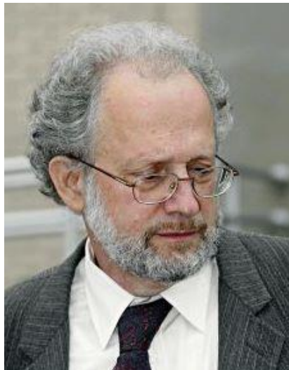
At Riverhead (NY) Supreme Court (8/29/06)